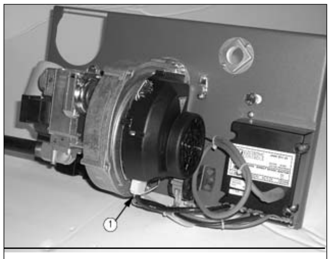
1. Blower assembly Molex